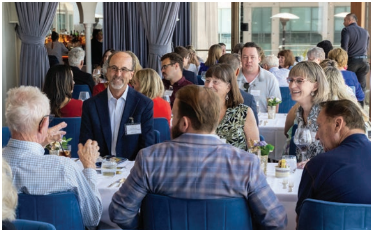
Guests enjoying Circle of Light luncheon.