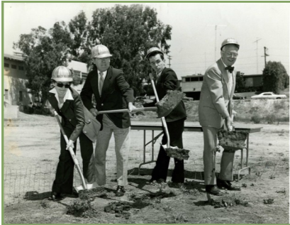
July 7, 1977 Groundbreaking - Arc Workshop

The Arc of San Diego depends on the generosity of the community. Although many of the services we offer are subsidized, the funding we receive does not fully cover the costs necessary to provide quality programs and services. We ask you to join us in fulfilling a pressing need for our consumers and their families.